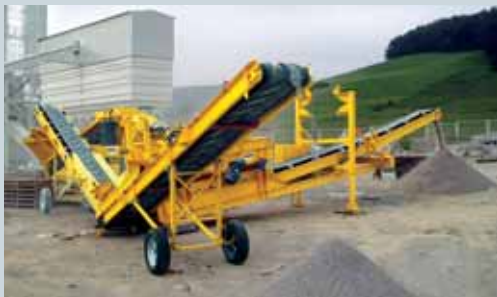
Profitable niches: recycled production waste can be separated in the container-mobile CS2500 and reused to save costs