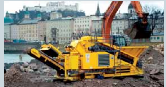
Appreciated by residents: thanks to series dust suppression and noise reducing cover