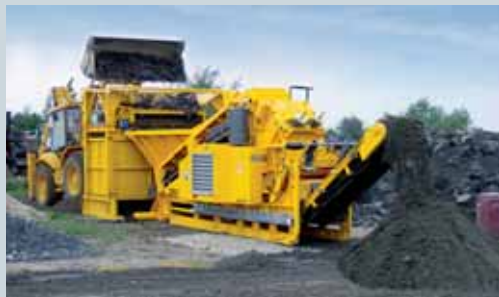
Less wear through pre-screening: the robust VS60 – also available with side conveyor belt – separates fines from the feed material

The impact crusher is easy to operate and all service jobs can be carried out from ground level. With high-performance components such as pre-screens and final screens, you can create a complete recycling centre. The building contractor becomes a service provider for companies and communities, creating clear, cost-efficient recycling loops. RUBBLE MASTER partners offer advice on optimum settings and site logistics on a case-to-case basis.