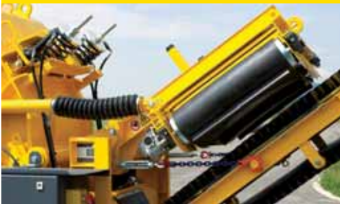
Indispensable: release system to remove blockages, plus reliable magnetic separator