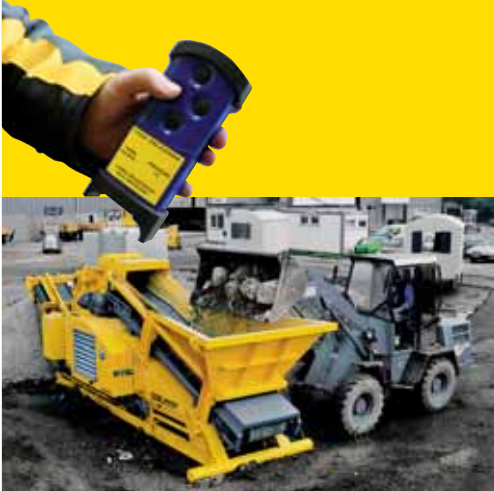
Easy handling: fed with small construction loaders (loading edge 190 cm), remote control optional