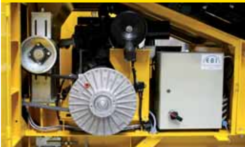
Efficient: automatic 2-step conveying and diesel / electric drive (9 to 12 l)

RUBBLE MASTER Compact Recyclers are the compact class for mobile processing: they are versatile in use, powerful and stable in value. They produce high-quality cubic value grain from construction debris and natural rock on-site and cost effectively. Thanks to their compact dimensions and low weight, they can be transported without any special permits. Proven technology, individual advice and the RM Lifetime Support programme enable the RUBBLE MASTER user to offer affordable, mobile recycling and establish a profitable line of business with exceptional quality. Because we are only satisfied when our customers are successful!