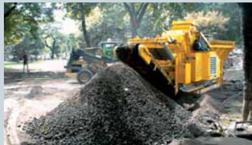
Success factor quality and pure sorting: up to 80 t/h cubic value grain from building debris, asphalt, concrete and in landscape design